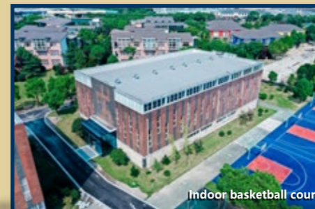
Indoor basketball court