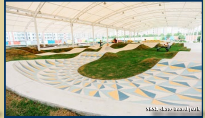
SBSX skate board park