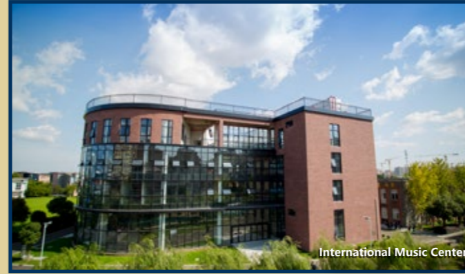
International Music Center