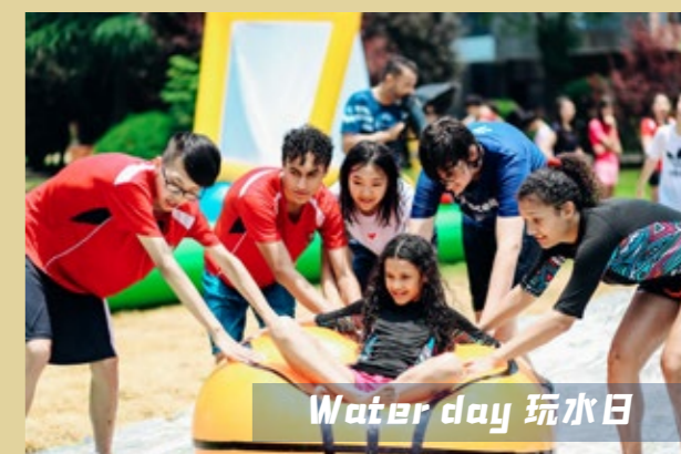
Water day 玩水日