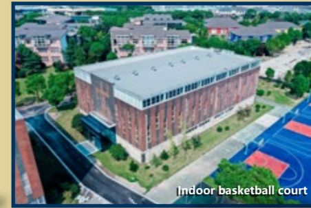
Indoor basketball court